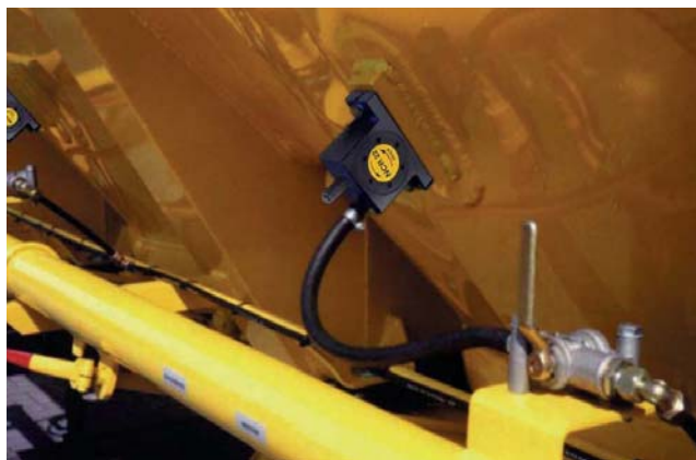
Emptying silo trailers