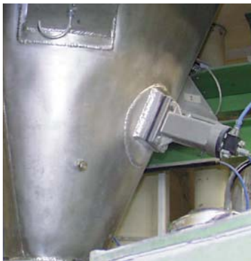
Cleaning bunker walls