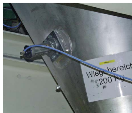
Cleaning weighing containers